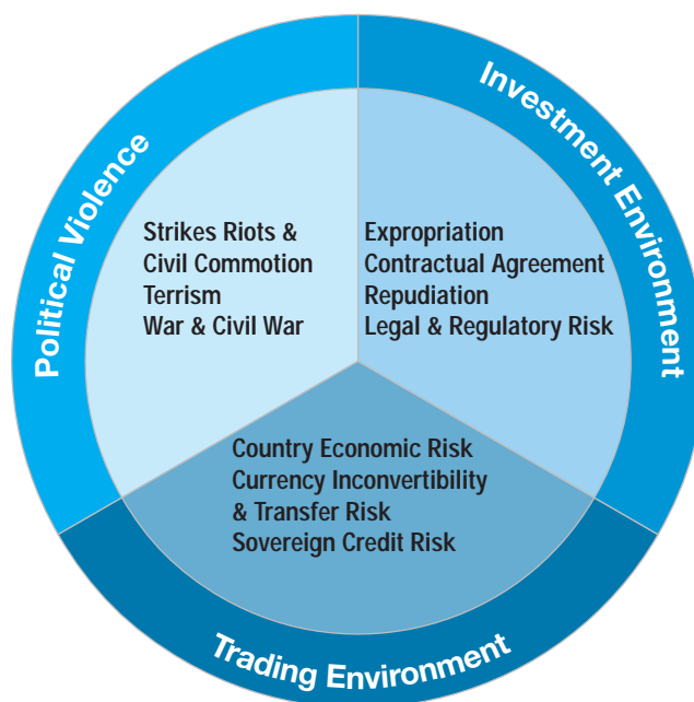
Diagram 1: The World Risk Review – nine perils falling into three broad categories

The World Risk Review™ has been developed to help corporations, banks and others involved in international trade and investment. It provides short to medium term assessment of the level of risk associated with a range of political and economic perils that could cause financial loss.